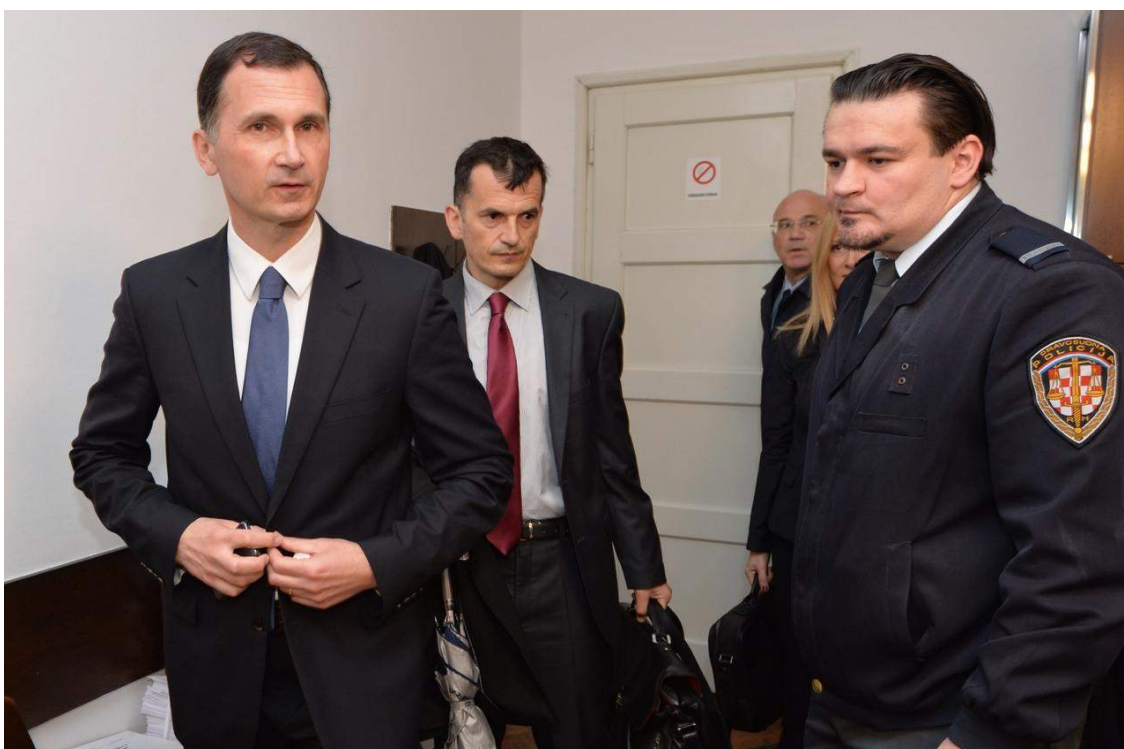
The former Minister of Science, Dragan Primorac (left)