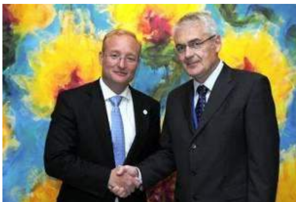
Croatia is faced with an international scandal