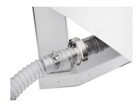
Choose between a stationary hose that can be autoclaved...

The drain system works automatically but can be operated by using the control panel on top of the Supply Unit.