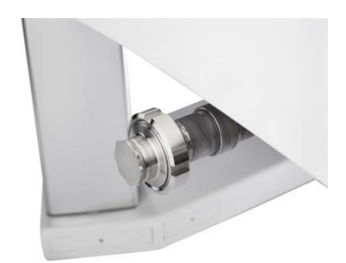
The outlet tube comes with a plug for disinfection.

or a hose for single use that is discarded after use.