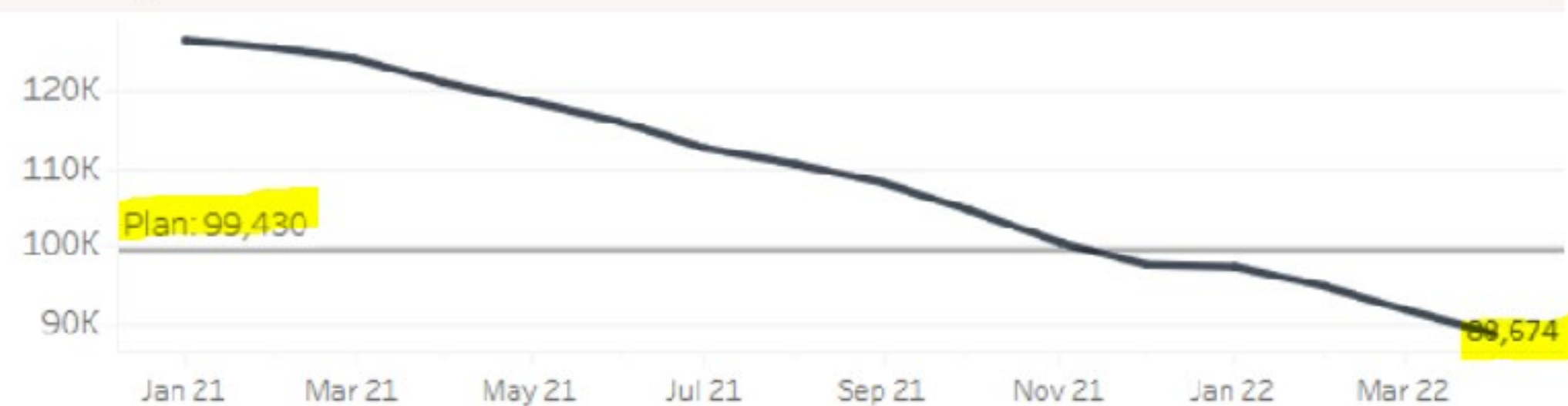
Grants by 1st examiner