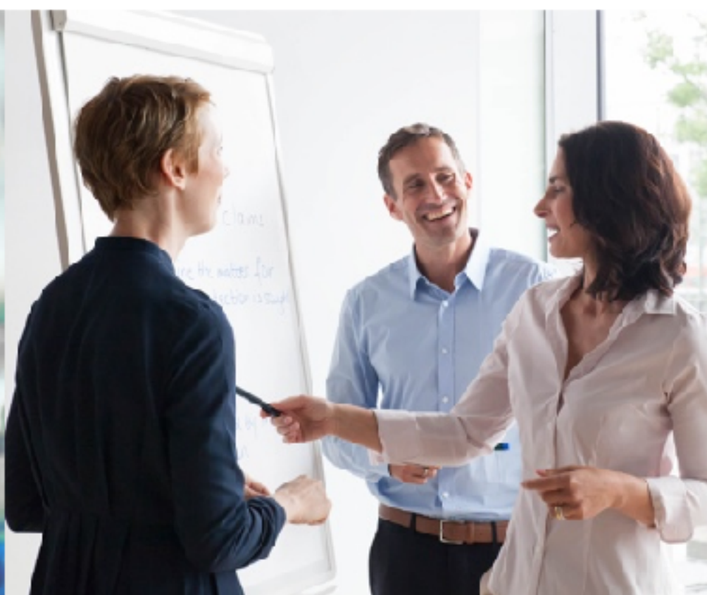
General Assembly of Staff Representation